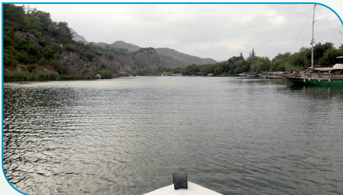
SEE YOU IN DALYAN AGAIN